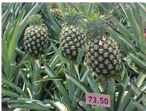
Plate 2. 73-50: the most promising 'piping-leaf' hybrid

high breeding values (Sanewski 1998). This genotype has the potential to replace Gandul in the canning industry, and it may also have a place in the fresh fruit market because of its high sugar and low acid contents.